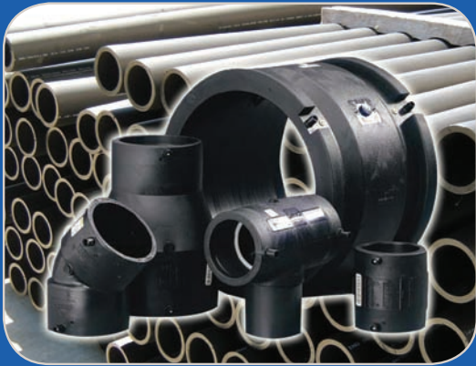
PE100 Pressure Pipe & Fittings