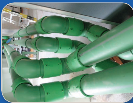
HVAC & Mechanical Services