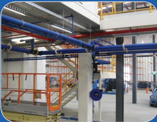
Maxair Compressed Air Pipe System