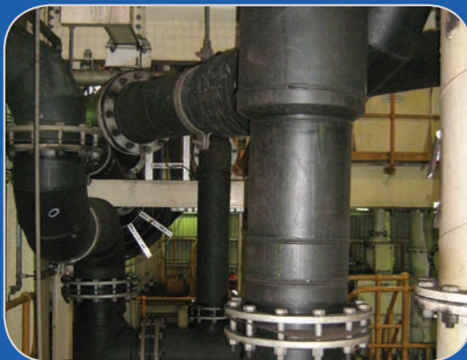
Specialists PE Fabrications