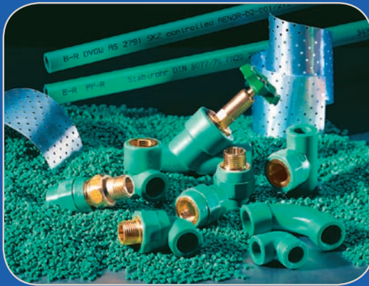
PP-R Hot & Cold Water Piping Systems