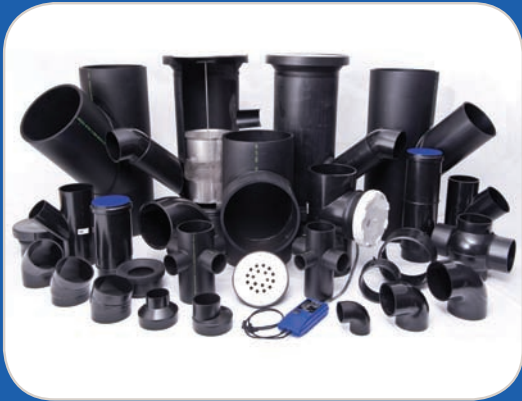
HDPE Drainage Systems