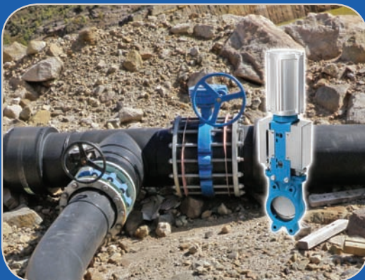
Control & Process Valves