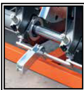
Detach device for heater