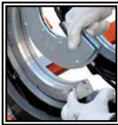
Inserts Ø 90 ÷ 280mm master Ø 250 mm