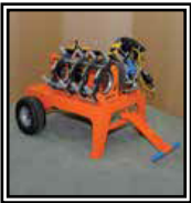
Trolley for machine body