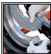
Inserts Ø 90 ÷ 280mm master Ø 250 mm