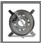
Tool for flange necks