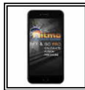
App "Set & Go Pro"

and: Inserts Ø 10" ÷ 24" IPS; 10" ÷ 20" DIPS; special transport wooden case or metal cage for body machine/ trolley - gearcase/plate/cutter