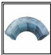
Inserts Ø 280 ÷ 560 mm